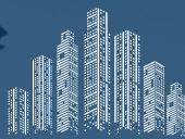
Mixed Use Developments